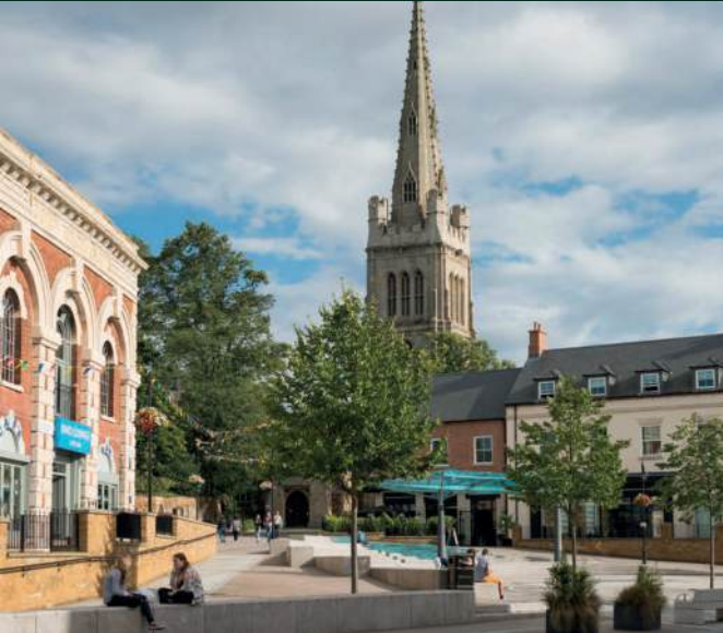
Market Place, Kettering

With so many fantastic destinations close by, life at Orbit Homes at Woodland Valley offers something new every weekend.