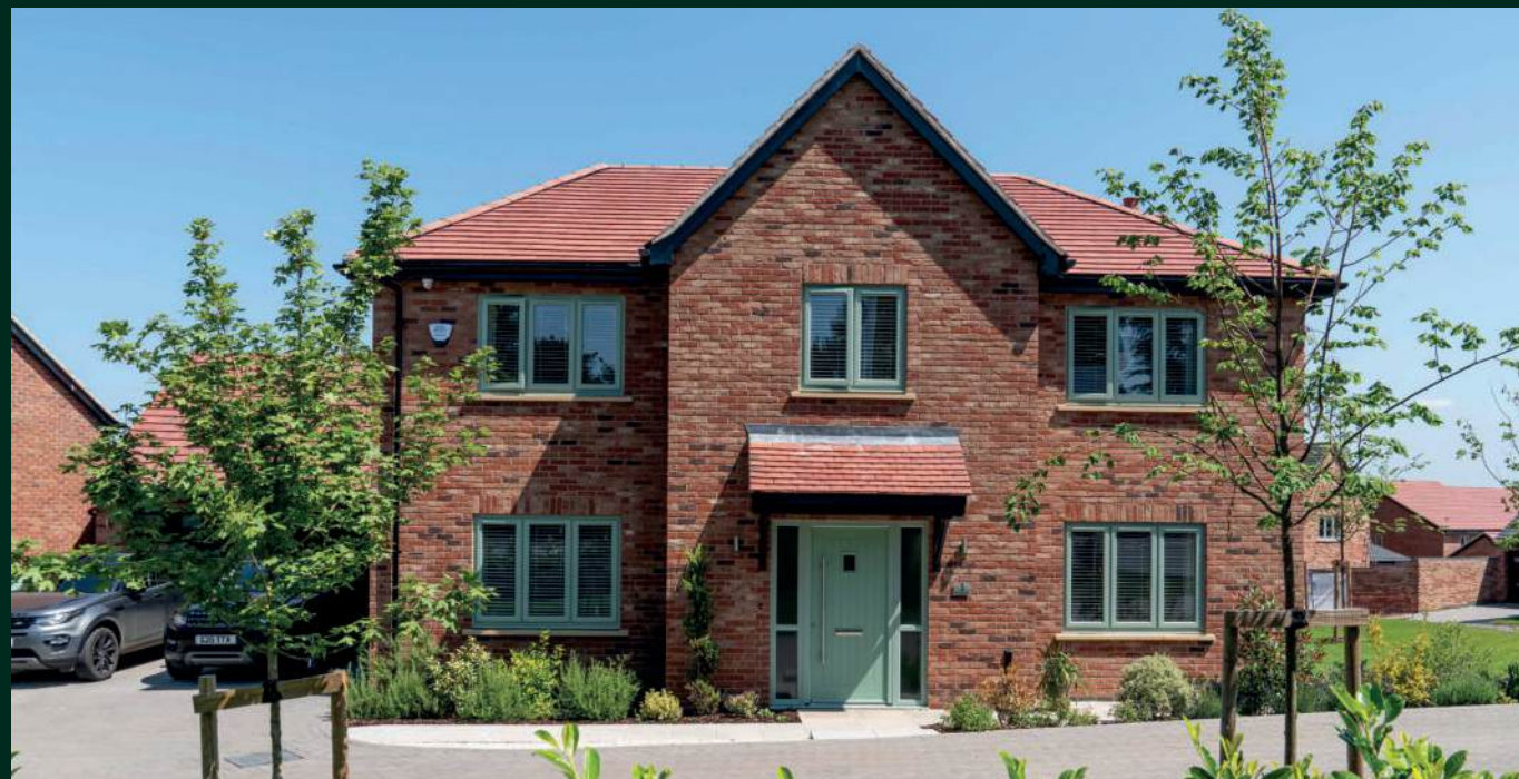
Chapel View, Shipston-on-Stour