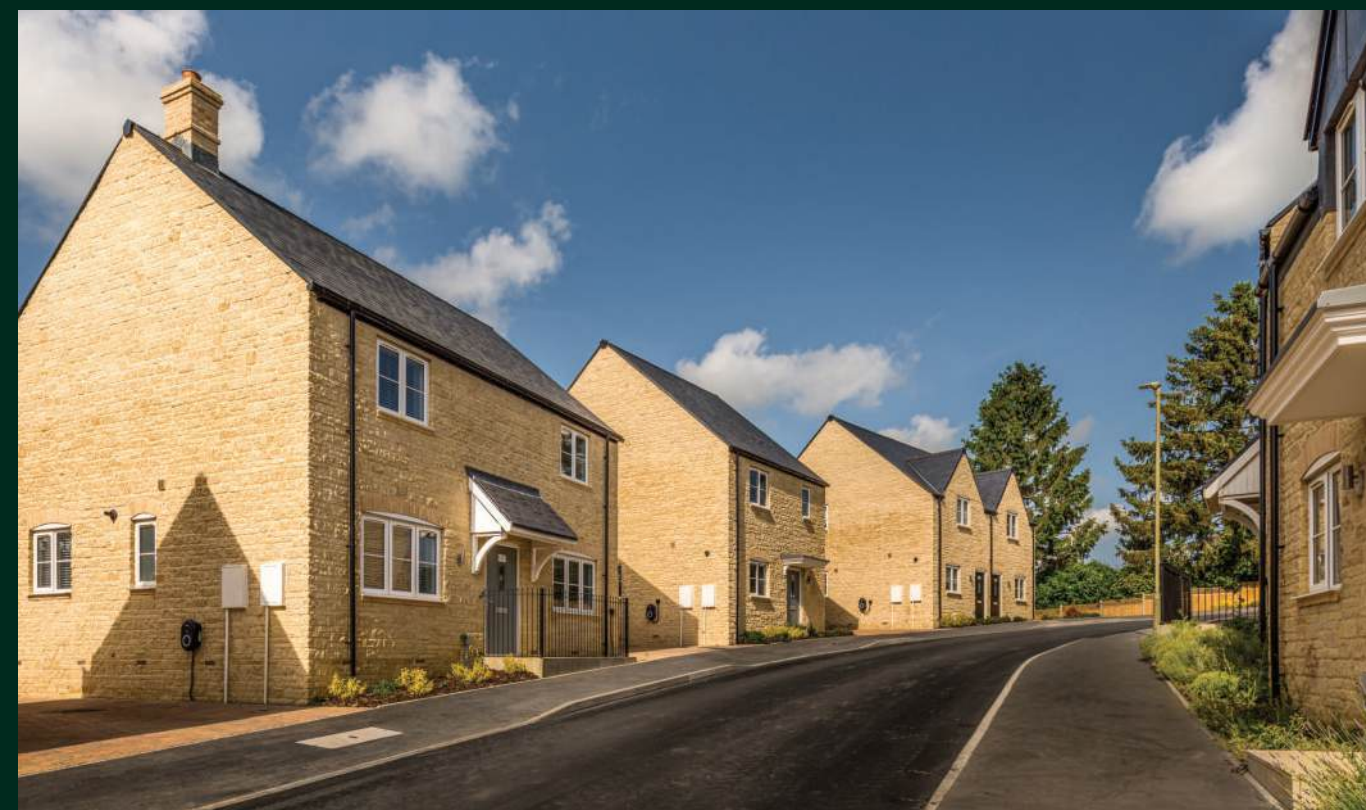
Enstone Leys, Enstone, Oxfordshire