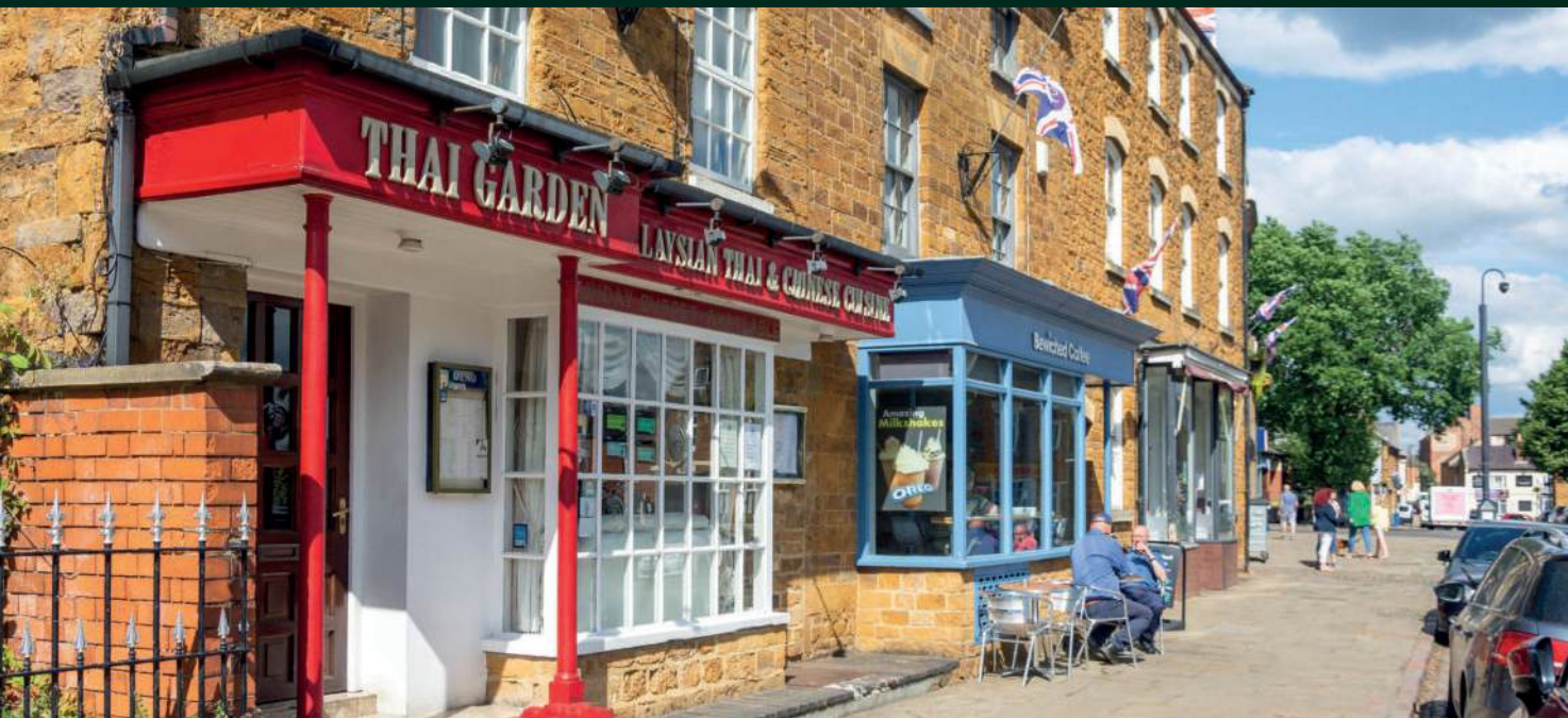
Market Hill, Rothwell