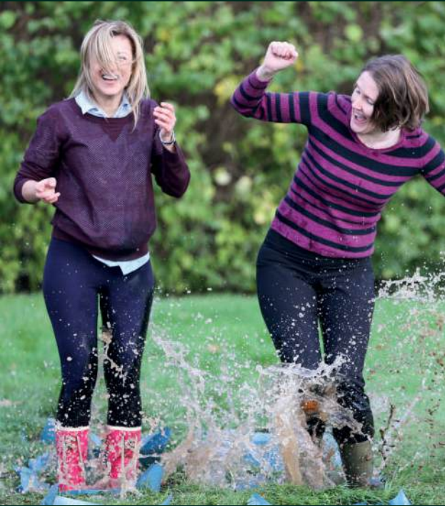
Puddle Jumping at Wicksteed Park, Kettering

Orbit Homes at Woodland Valley enjoys excellent transport links that connect you to everything from peaceful countryside to lively cities.