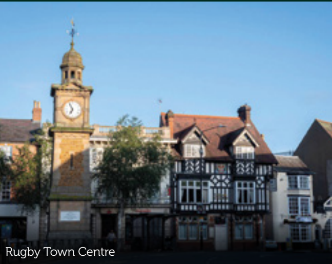
Rugby Town Centre