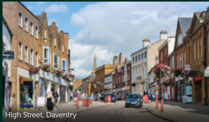
High Street, Daventry

This unique new community is conveniently located on the northern outskirts of Daventry within easy reach of this thriving market town.