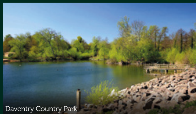
Daventry Country Park

There is also a selection of local schools that all sit within minutes of your door, ranging from primary right through to Sixth Form. With all this close by, it's easy to see why Micklewell Park makes the ideal home for all the family.