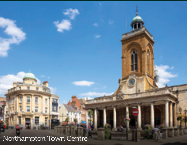
Northampton Town Centre