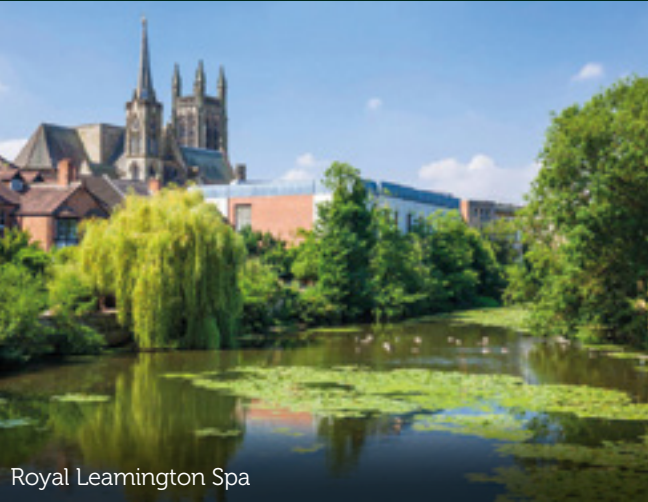
Royal Leamington Spa

International travel is also well catered for too with Birmingham Airport 44 minutes away and Luton Airport around an hour by car; departure points for sun, ski, and city destinations around the globe.