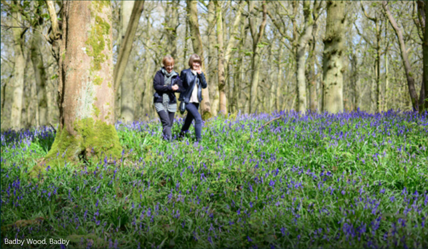
Badby Wood, Badby