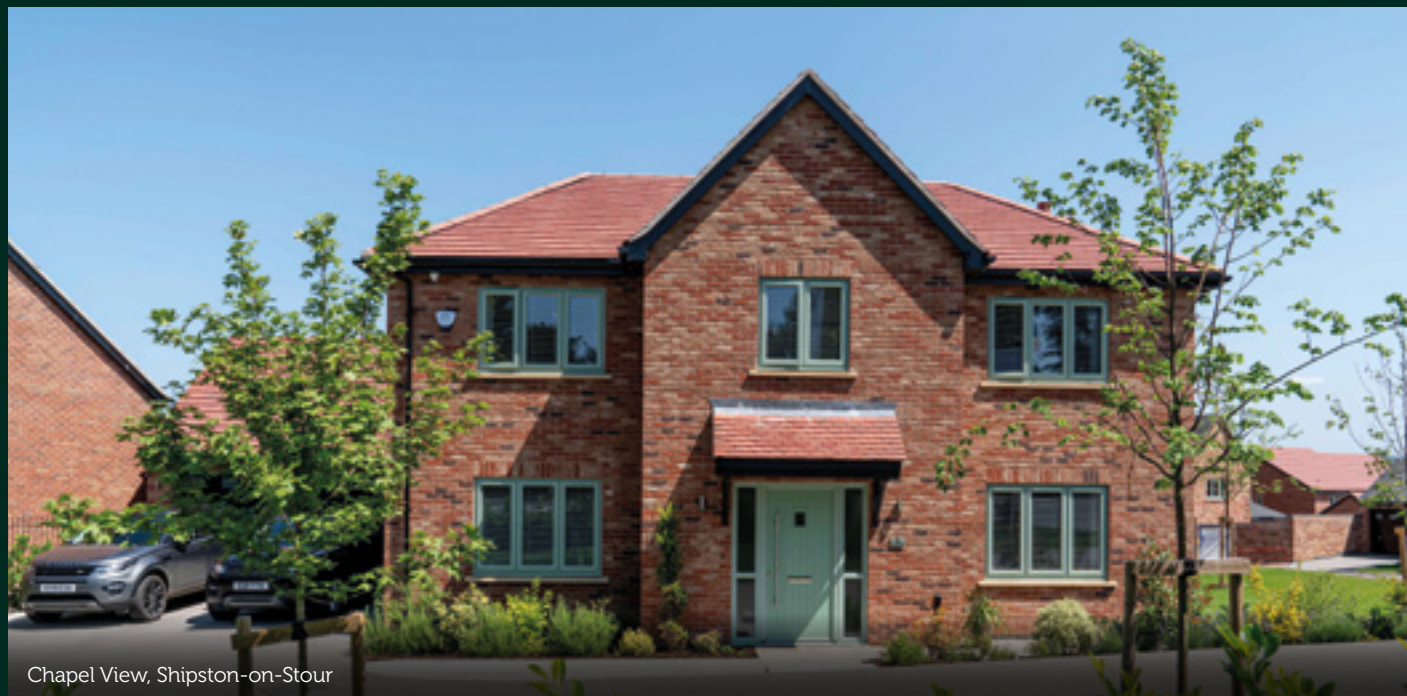
Chapel View, Shipston-on-Stour