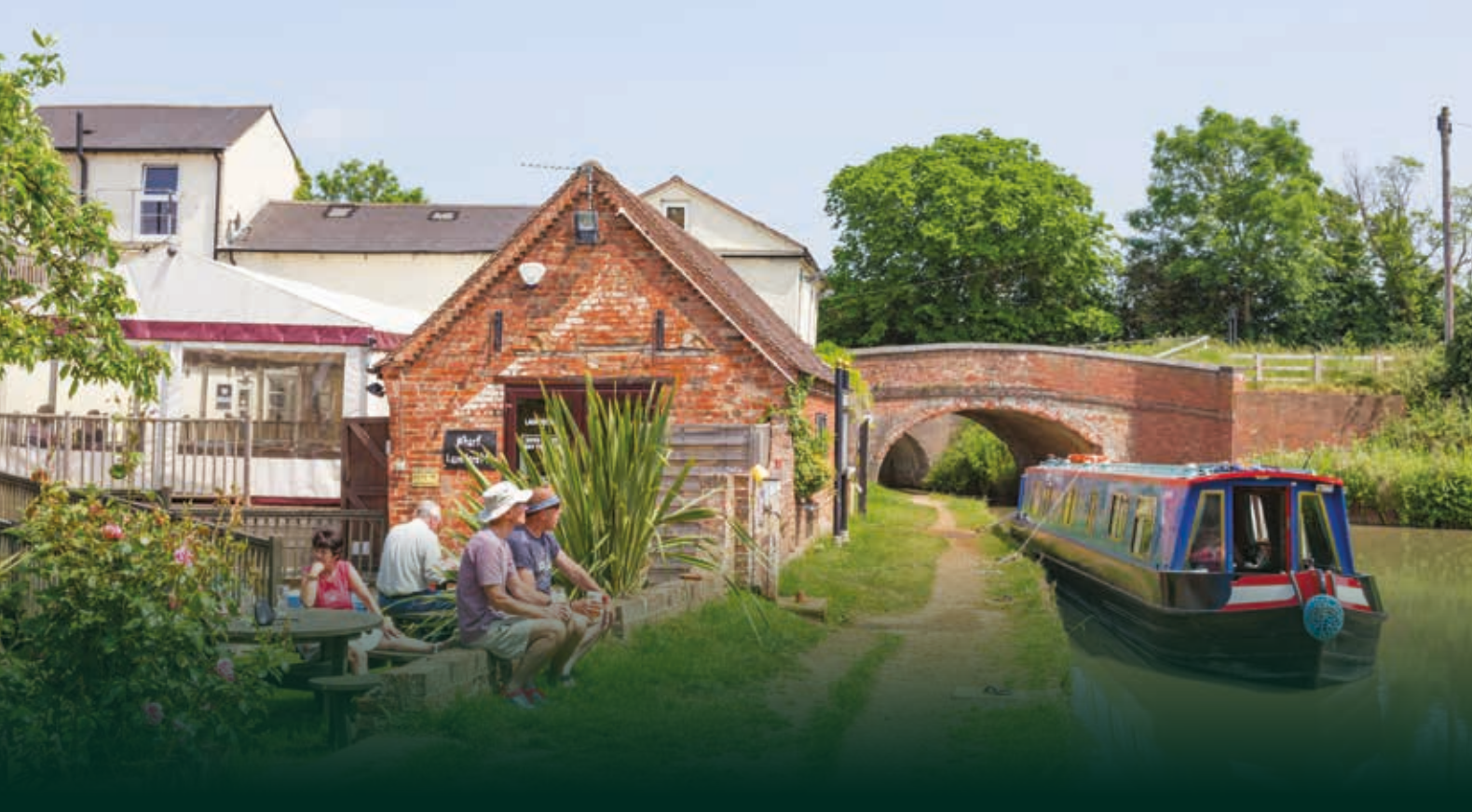
Fenny Compton Wharf