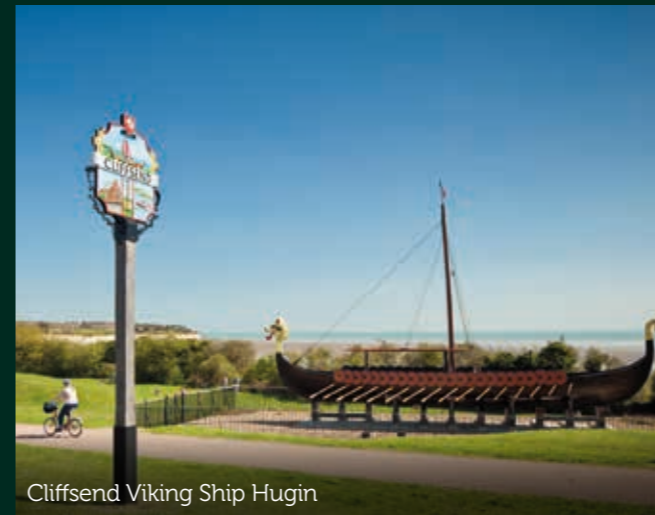
Cliffsend Viking Ship Hugin