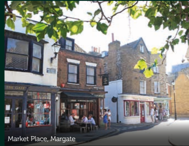
Market Place, Margate