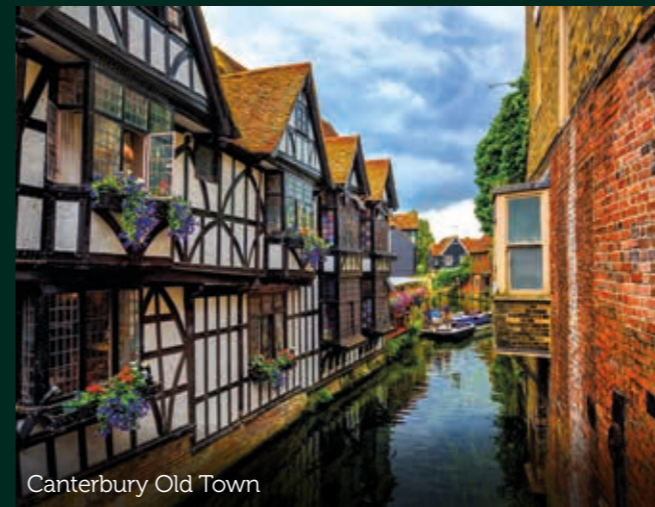
Canterbury Old Town