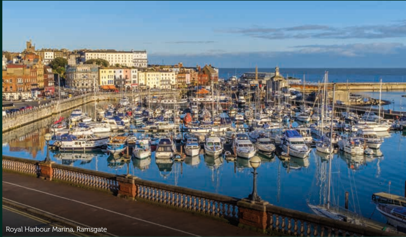
Royal Harbour Marina, Ramsgate