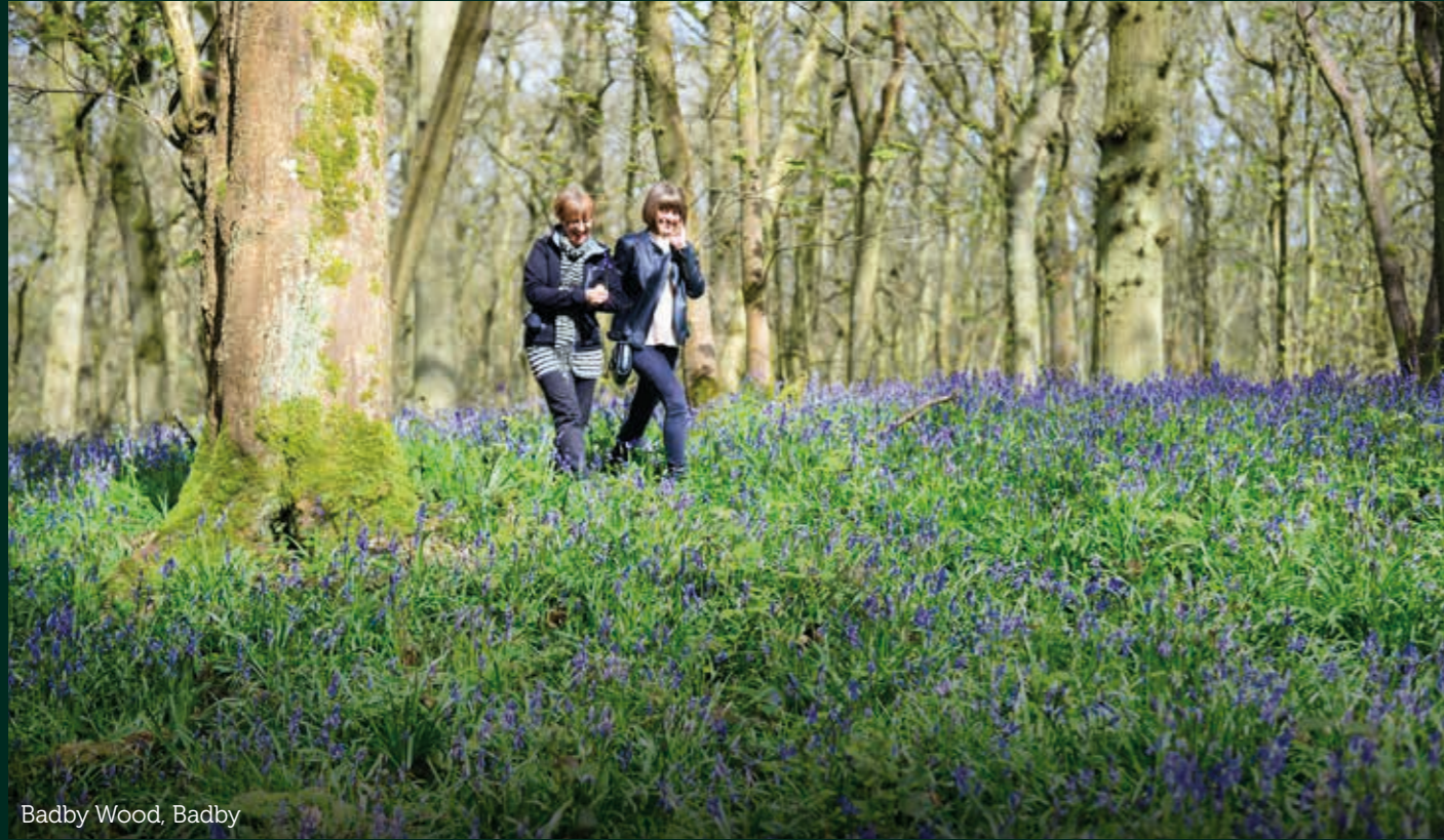
Badby Wood, Badby