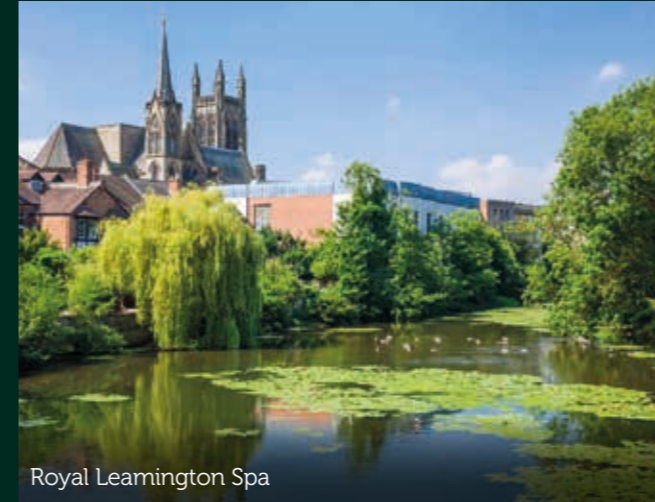
Royal Leamington Spa

International travel is also well catered for too with Birmingham Airport 44 minutes away and Luton Airport around an hour by car; departure points for sun, ski, and city destinations around the globe.