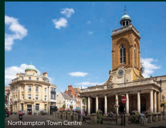
Northampton Town Centre