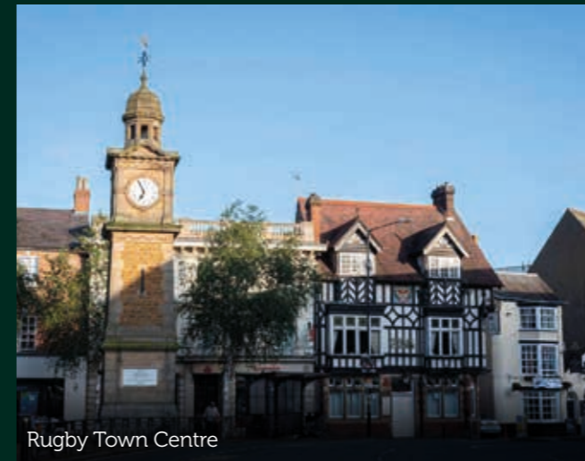
Rugby Town Centre