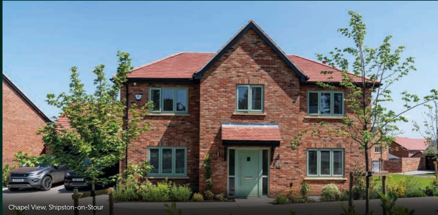
Chapel View, Shipston-on-Stour