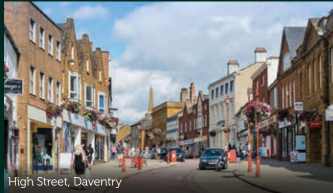
High Street, Daventry

This unique new community is conveniently located on the northern outskirts of Daventry within easy reach of this thriving market town.