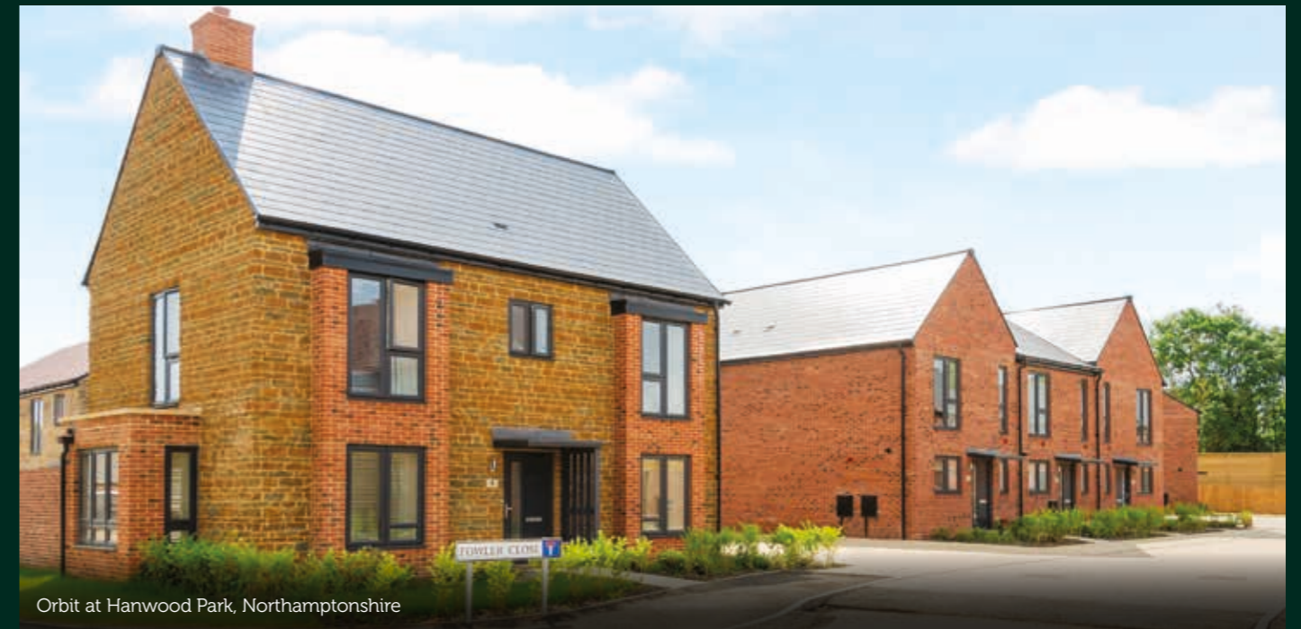
Orbit at Hanwood Park, Northamptonshire

A key objective of Orbit Earth is becoming net zero carbon and our operational carbon footprint has reduced by 21% since 2018-19 with initiatives like investing in lower-carbon tools, switching to 100% renewable electricity for offices and communal areas where feasible, and many more. We continue to explore the potential of new technologies and methods such as off-site modular construction. Orbit Earth is an ongoing process, but it is already benefitting people - not just our residents - and the planet.