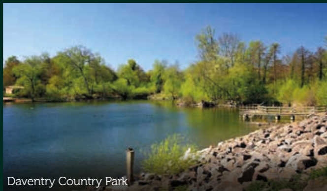
Daventry Country Park

There is also a selection of local schools that all sit within minutes of your door, ranging from primary right through to Sixth Form. With all this close by, it's easy to see why Micklewell Park makes the ideal home for all the family.