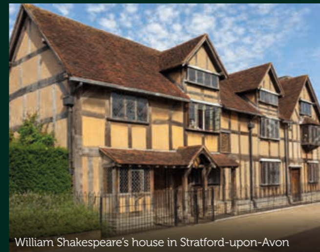
William Shakespeare's house in Stratford-upon-Avon