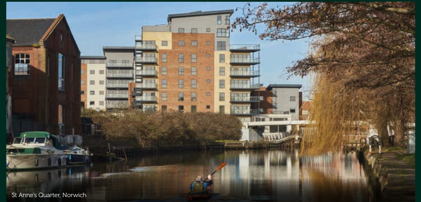
St Anne's Quarter, Norwich