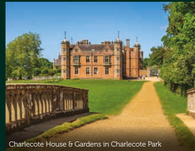
Charlecote House & Gardens in Charlecote Park