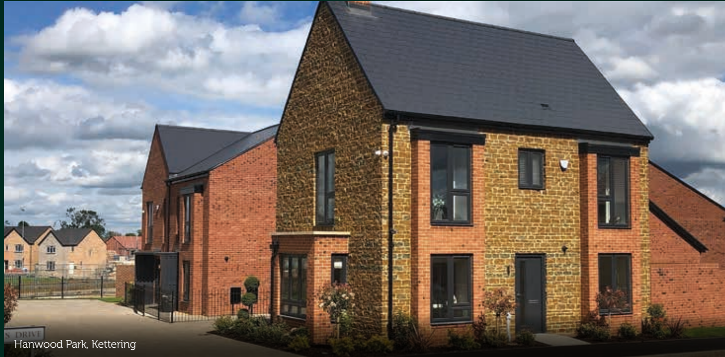
Hanwood Park, Kettering