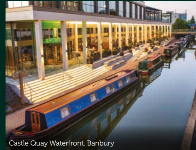
Castle Quay Waterfront, Banbury

For family days out, Compton Verney offers a fantastic mix of art exhibitions, walking trails, children's activities and play areas.