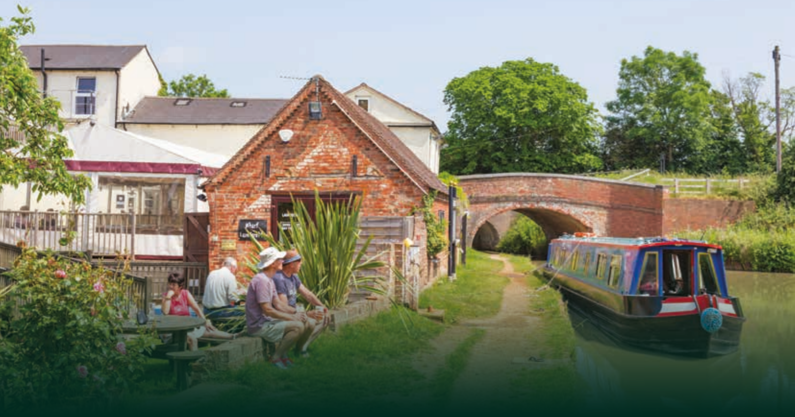
Fenny Compton Wharf