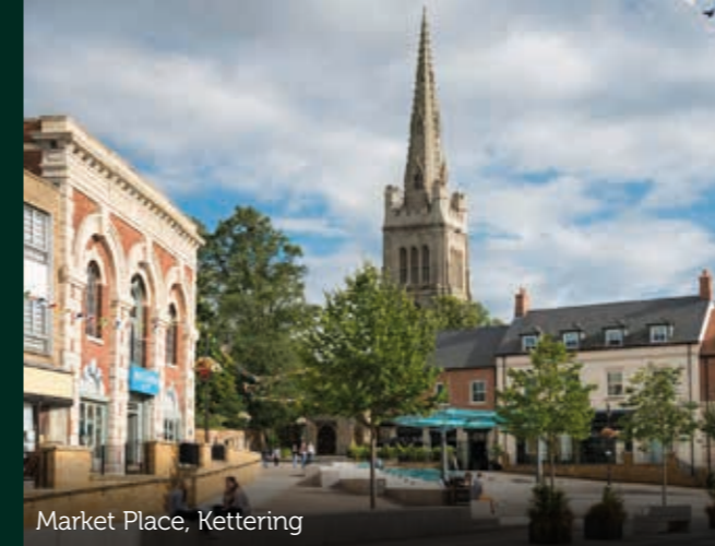
Market Place, Kettering

For trips even further afield, Birmingham, Stansted and Luton Airports can all be reached in around an hour, between them offering flights to hundreds of destinations around the world.