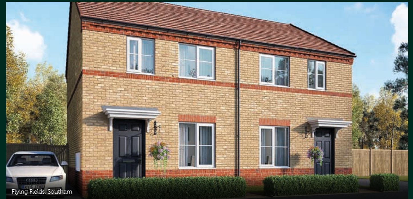
Flying Fields, Southam