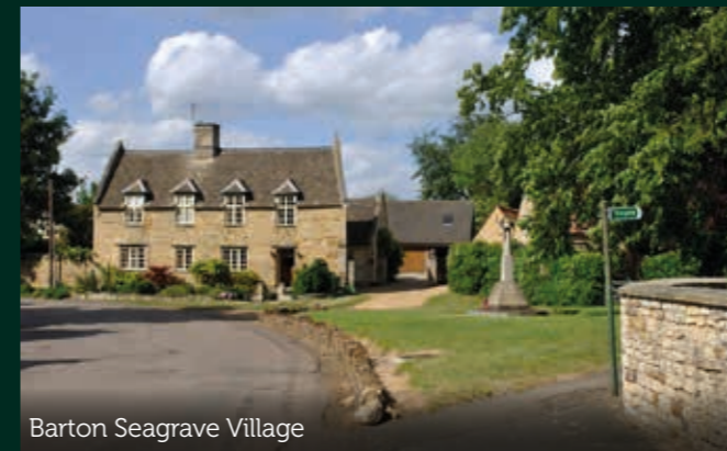
Barton Seagrave Village

This fantastic new collection of 2 and 3 bedroom Shared Ownership homes is located in Barton Seagrave, surrounded by beautiful countryside and just minutes from the bustling market town of Kettering.