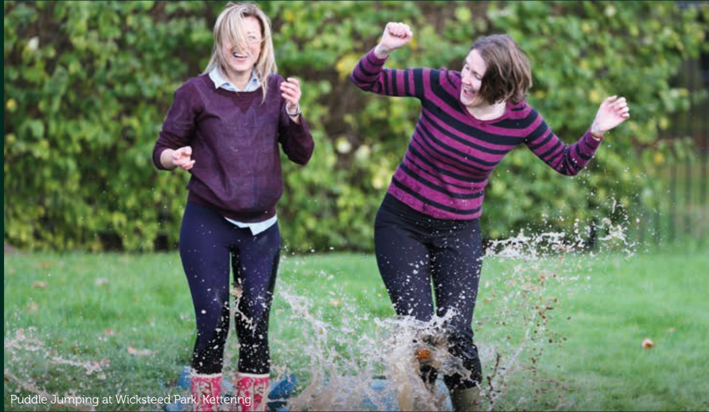
Puddle Jumping at Wicksteed Park, Kettering