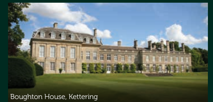
Boughton House, Kettering

Finally, if you prefer to connect with nature, the spectacular Stanwick Lakes are easily reached and provide the perfect place to walk, run, ride and much more in the natural beauty of the Nene Valley.